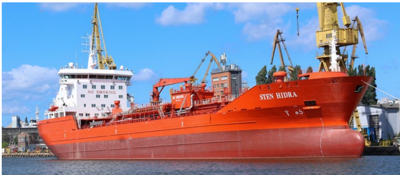
The newly painted Sten Hydra with a BWT System installed at Remontowa in 2022